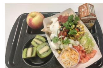
Burrito bowl with fresh kiwi halves and apple