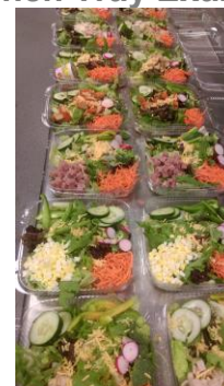
Daily salad options