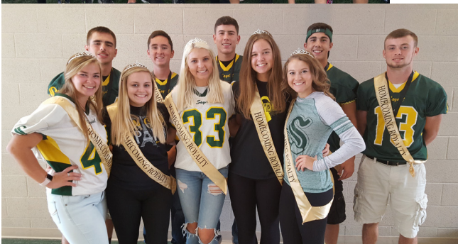
Saydel High School Celebrated Homecoming Week 9/15/17